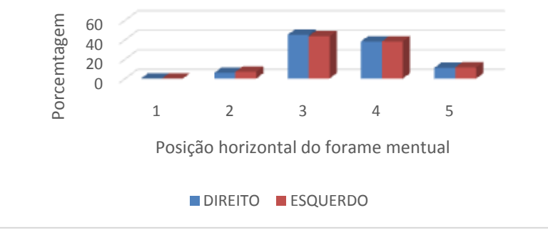
Fig 1 - Distribution of frequencies (%) of the horizontal position of the mental foramen in the analyzed sample.

Legend: 1. anterior to the long axis of the first lower premolar; 2. in line with the long axis of the first lower premolar; 3. between the long axes of the first and second lower premolars; 4. in line with the long axis of the